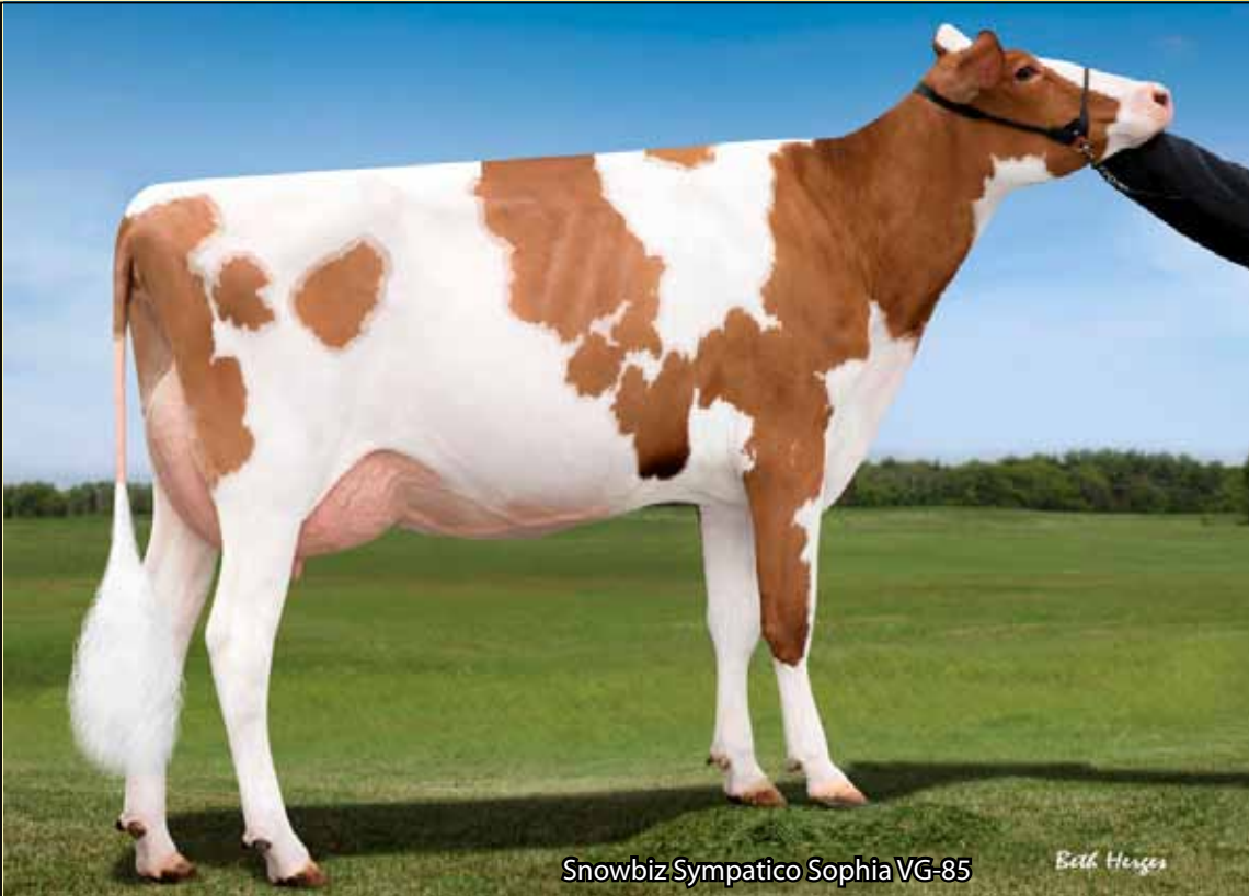
Snowbiz Sympatico Sophia VG-85